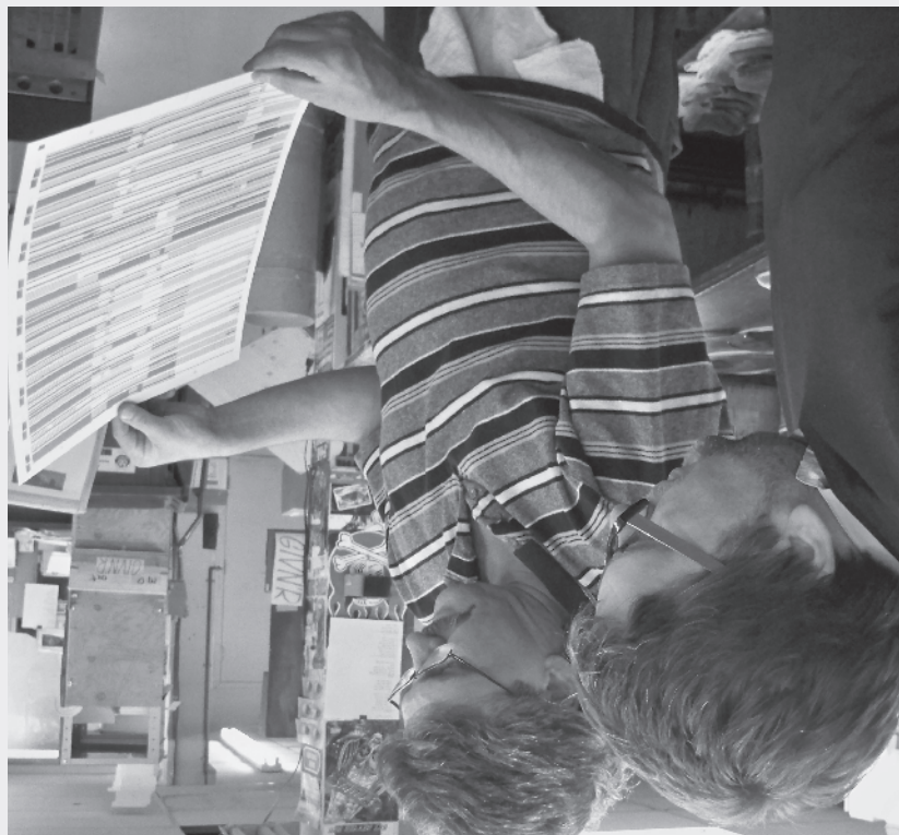
The Plug In Notebook By Plug In Editions

Plug In Editions presents a collaboration with Urban Ink Design: The Plug In Notebook. This handsome unlimited edition notebook comes in various styles featuring non-photo blue ink lined pages in various patterns. The Notebook is XX pages, with silver-grey cloth hardcover, a colour ribbon page marker and lay-flat binding for ease of use. This discrete notebook will keep all your secrets, dreams, dates, notes, plans and ideas in one safe and convenient place. Available at Plug In ICA and our online shop at www.plugin.org . All proceeds from this edition support Plug In's ongoing programs.