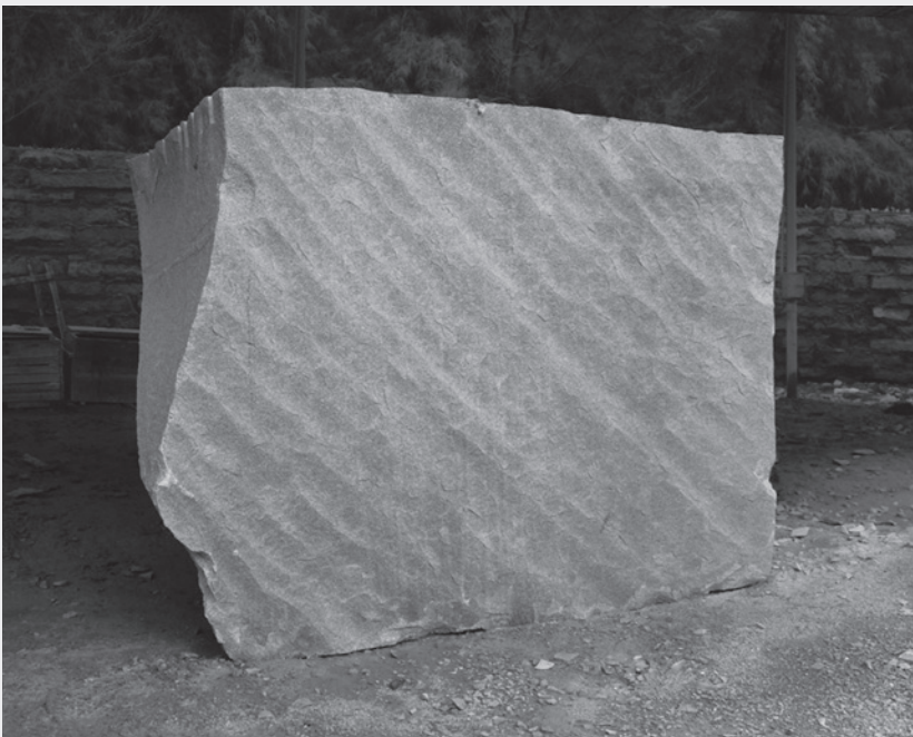
Monument, in progress. Michel de Broin, granite, 230 x 150 cm, 2009

Reception: Thursday, September 17 at 5 pm